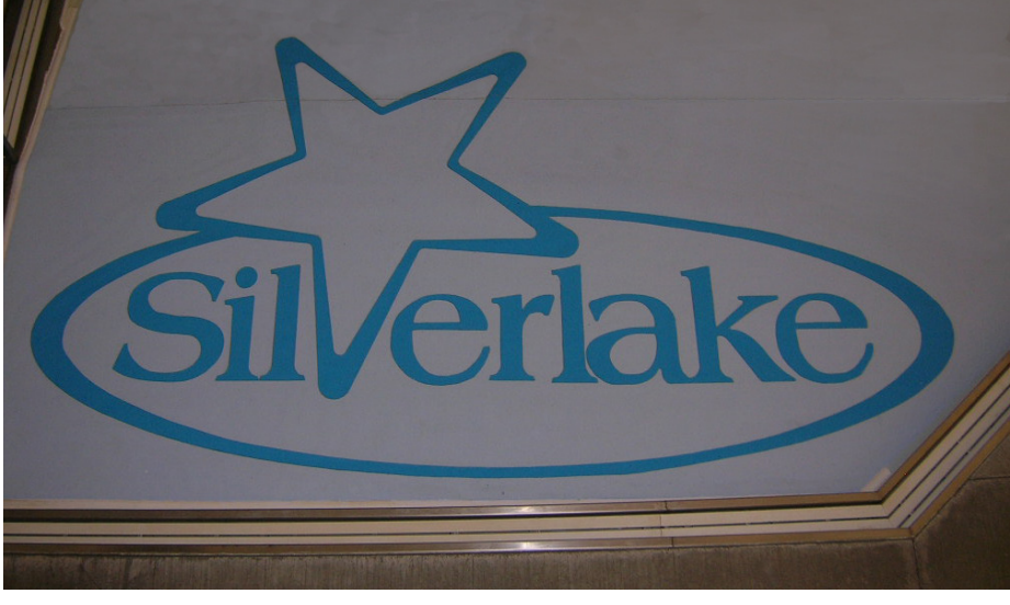
Silverlake Recreation Center in Erlanger, KY, asked us to create this custom logo for the leisure pool. This was easily done with two different shades of our Natatec.

Emergency Generator Fuel Storage Area, Anchorage, AK Fuel Spill Containment Area, Michigan National Guard Hyatt Regency Crown Center Fountain, Kansas City, KS Municipal Water Treatment Plant, Tonawanda, NY Waste Water Storage Tank, Ft. Belvior, VA Water Diversion System, Buffalo, NY