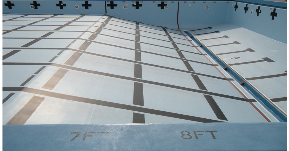
Camp Foster -- Okinawa, Japan

Berkeley Pool, Seymour Johnson Air Force Base, Goldsboro Camp Bonner, Washington High Point Swim Club, High Point Lenox Baker Hospital, Durham Lindley Swimming Pool, Greensboro Marine Corps Air Station, Cherry Point