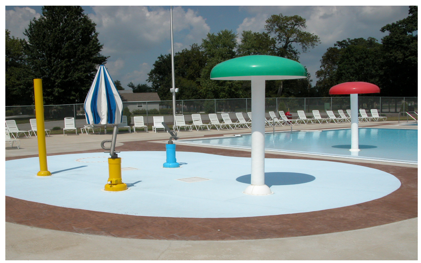
Roberts Park - Connersville, IN (2005) Many facilities ask us to place our Natatec system in their splash areas to help keep water in the right area while creating a non-skid surface with our certified ASTM C1028 slip resistant textured membrane.

Mountainbrook Swim Club, Charlotte Westin Hotel, Charlotte NORTH DAKOTA