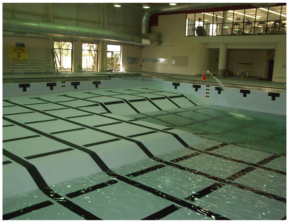
Longview Community College - Lees Summit MO (25 Meters x 25 yards with diving area and off set ramp)