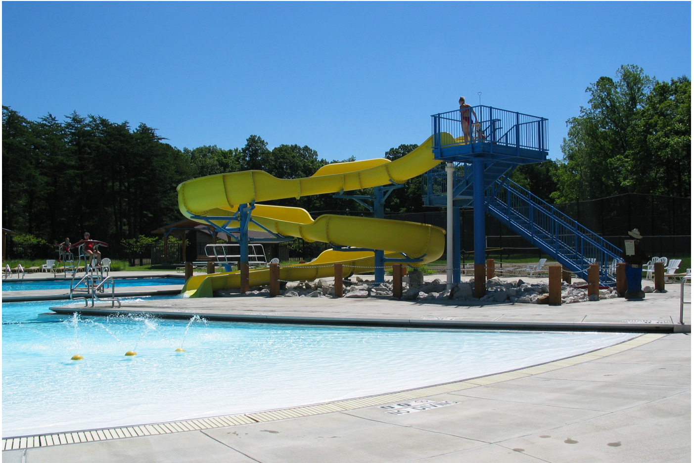
Lieber State Recreation Area - Cloverdale, IN (Showing a V-Series semi-recessed perimeter gutter system with a rollout zero depth entry gutter system.)

Roeper School, Bloomfield Hills Southwestern High School, Detroit Sports Club of Novi, Novi Spring Lake Country Club, Spring Lake Travis Pointe Country Club, Ann Arbor Timber Wolf Lake, Lake City Veteran's Memorial Pool Rehabilitation, Melvindale Watermark Country Club, Grand Rapids Woodside Athletic Club, Beverly Hills