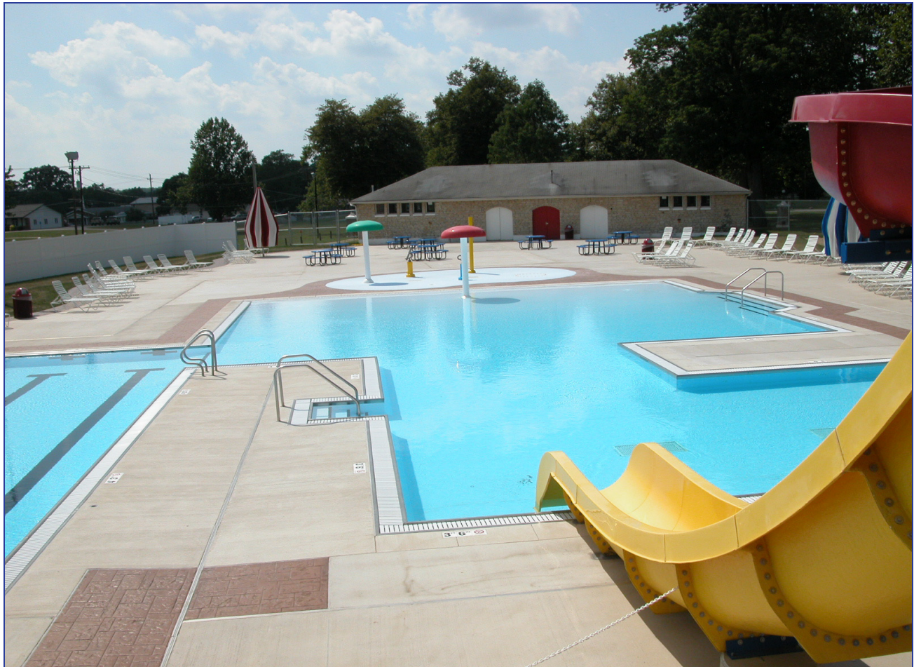
Roberts Park - Connersville, IN (Picture shows a V-series rollout perimeter gutter with a rollout zero depth entry gutter combination)