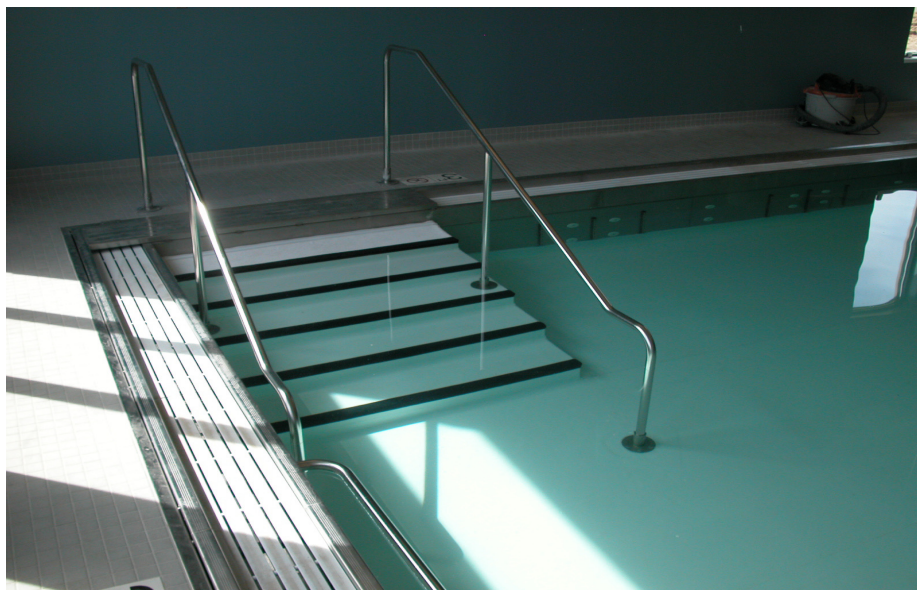
Cardinal Health Systems - Muncie, IN (Showing a V-series rollout perimeter gutter system)

550 St Clair, Chicago 600 Fairbanks Court, Chicago Boy Scout Camp Swimming Pool, Peoria Burke Park Pool, Monticello Carle Hospital Therapy Pool, Urbana Carlyle Swimming Pool, Carlyle Central Park Pool, Oak Lawn Charleston Rotary Pool, Charleston Clyde Park District, Cicero Country Club of Decatur, Decatur Easter Seal Rehabilitation Center, Peoria Eckhart Park, Chicago Eisenhower Pool, Springfield Eldon Hazlet State Park, Carlyle Fairview Aquatic Center, Normal Fit Club, Springfield Fox Valley YMCA, Plano Galesburg High School Recreational Facility, Galesburg Harrison Park, Chicago Hayes Park Natatorium, Chicago Indian Acres Swim Club, Champaign Kelly Curie Gage Park High School, Chicago Lufkin Park Pool, Villa Park Marriott Park, Oakbrook Mason City Park District Pool, Mason City Metamora Swimming Pool, Metamora Metea Valley Middle School, Aurora Morton Swimming Pool Complex, Morton Prestwick Country Club, Chicago River Forest Tennis Club, River Forest Rock River Country Club, Rock River Tremont Community Pool, Tremont Tri-City Country Club, Moline Village III Condominiums, Chicago Wabash Residences, Chicago West Frankfort Swimming Pool,