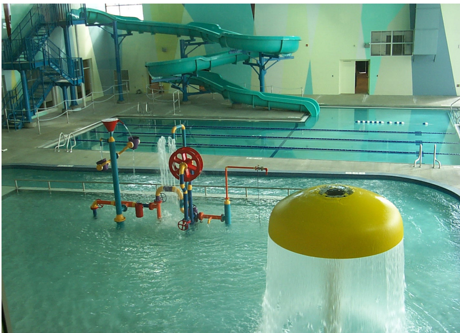
Legacy Park - Lee's Summit, MO Above: Close up of the lap/slide pool using our MicroFlo MS Series semi-recessed gutter system.