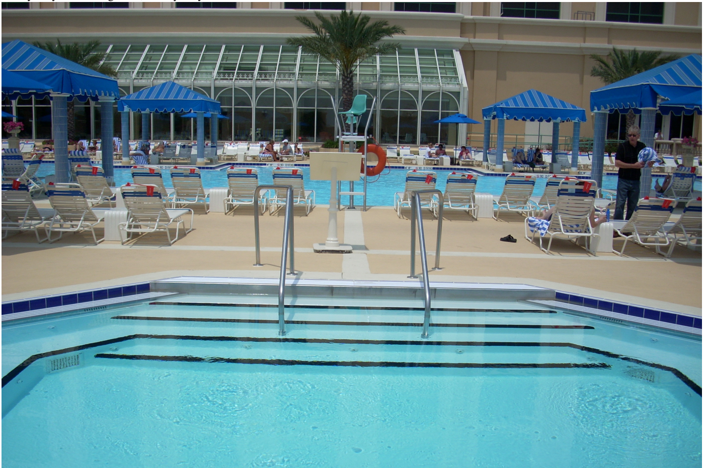
Beau Rivage Casino, Biloxi, MS (Showing our MicroFlo MS series rollout perimeter gutter system with ceramic tile and grating)

Berryville Community Center, Berryville Clarksville YMCA, Clarksville Davis YMCA, Memphis Germantown Civic Center, Germantown Hillwood Country Club, Nashville Jimmy Floyd Family Center, Lebanon Joe Davis YMCA Day Camp, Nashville Legends Ridge, Franklin Morris Pool, Memphis Murfreesboro & Franklin YMCA, Murfreesboro & Franklin New Providence Pool, Clarksville Norwest Gibson County YMCA, Trenton Orange Mound Community Center, Mem- phis