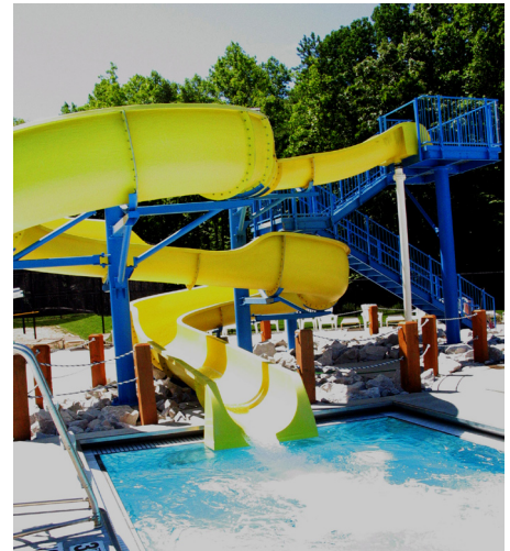
Lieber State Recreation Area - Cloverdale, IN (Showing how easily slides and other equipment can work with our systems.)

Carbonear Municipal Pool, Carbonear, Newfoundland, Canada Centre Recreatif, Ouje-Bougoumou, Quebec, Canada Seven Oaks General Hospital, Winnipeg, Manitoba, Canada Peace Vector VI, Fayed, Egypt Barbican Health and Fitness, London, England Naval Fitness Center, Guam Swimming Complex, Sundmidstod, Iceland LatPoolSIA, Latvia Trace Aquatic Center, Philippines ( Site of the 2005 Southeast Asian Games )