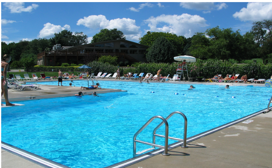
Bloomington Country Club - Bloomington, IN (Showing our MicroFlo V-series rollout gutter system)