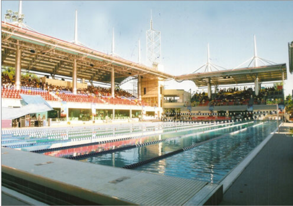
Trace Aquatic Center - Philippines (Picture: main competition pool showing the MS series rollout perimeter gutter system and our Movable Bulkhead System.) Not shown: Two V-series gutter systems for their diving well and practice pools.

5905 W. 74th Street • Indianapolis, IN 46278 • USA (800) 336-8828 • (317) 290-8828 • FAX (317) 290-9998 www.natare.com • natare@natare.com