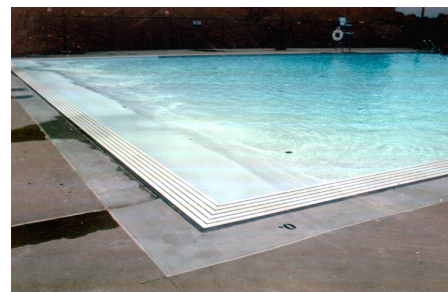
Rollout zero depth entry perimeter gutter system

Dynamo Swim Club, Alpharetta Hinesville YMCA, Hinesville MidCity Lofts, Atlanta Morgan County Pool, Madison