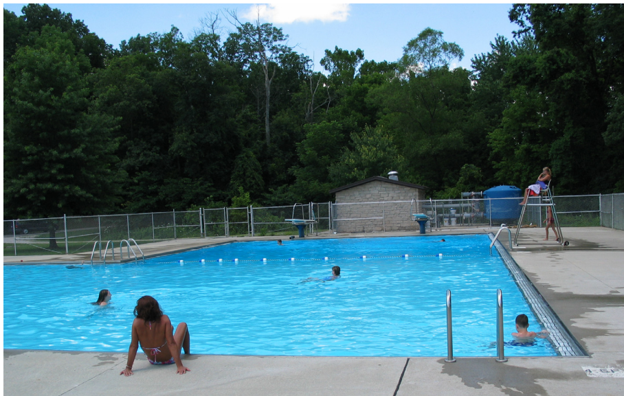
Spring Mill State Park - Mitchell, IN (Installed a V-series semi-recessed perimeter gutter system and MicroFlo® Hi-Rate Vertical Sand Filtration System)